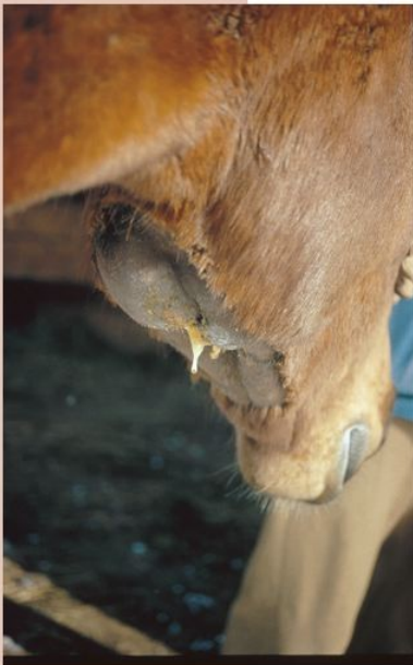
Draining lymph nodes.

Strangles – A highly contagious, but rarely fatal bacterial disease caused by the Streptococcus equi organism. There may be some side effects associated with vaccination (available in both injectable and intranasal forms).